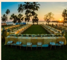
The Wedding Venues

Flowers, Music, Photography: Our Wedding Planner has a comprehensive database of wedding specialists in Goa and will co-ordinate floral arrangements, photographers, videographers and entertainment requests. Once you have secured your wedding date, our Wedding Planner would be happy to assist in handling all the details for your wedding.