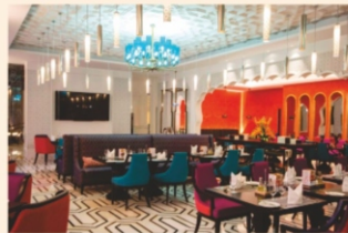
Hotel Wedding Venues