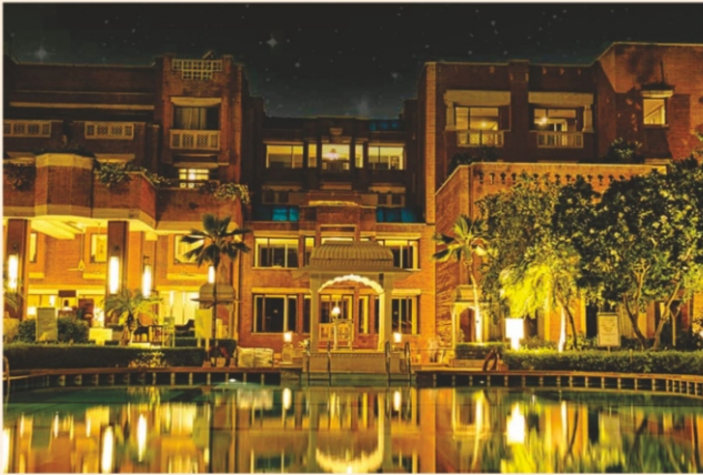
ITC Rajputana, Jaipur

ITC HOTEL RESPONSIBLE LUXURY ITC RAJPUTANA THE LUXURY COLLECTION