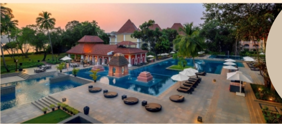
Grand Hyatt Goa

GRAND | HYATT Grand Hyatt Goa P.O. Goa University, Bambolim - 403206, Goa Tel: +91 832 664 1234 Fax: +91 832 664 1234 Email: grandhyattgoa@hyatt.com Website: www.hyatt.com